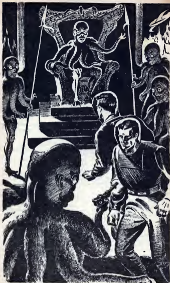
O'Dea whirled—to face a lifted shock gun.