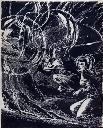
The spheres ratted down in a deadly wave.

The barbaric rhythms of the Congohua , were a background of annoyance in Dennis' mind; he frowned slightly at the maneuvers of the Mercurian dancer who writhed among the guests of the notorious pleasure palace, began to leave no doubt