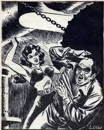
Keren whirled and lunged at the screaming Mercurian.

"I T'S TOO RISKY for you to go alone, Johnny," Rick Norman said.