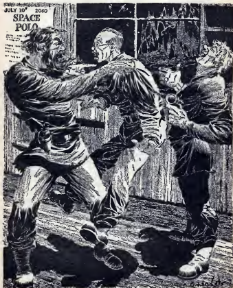
"Ulp!" ulped Mr. Meek shakily.

A bit bewildered, but determined not to show it, Meek swung away from the signpost and gravely regarded the settlement. On the chart it was indicated by a fairly sizeable dot, but that was merely a matter of comparison. Out Saturn-way even the tiniest outpost assumes importance far beyond its size.